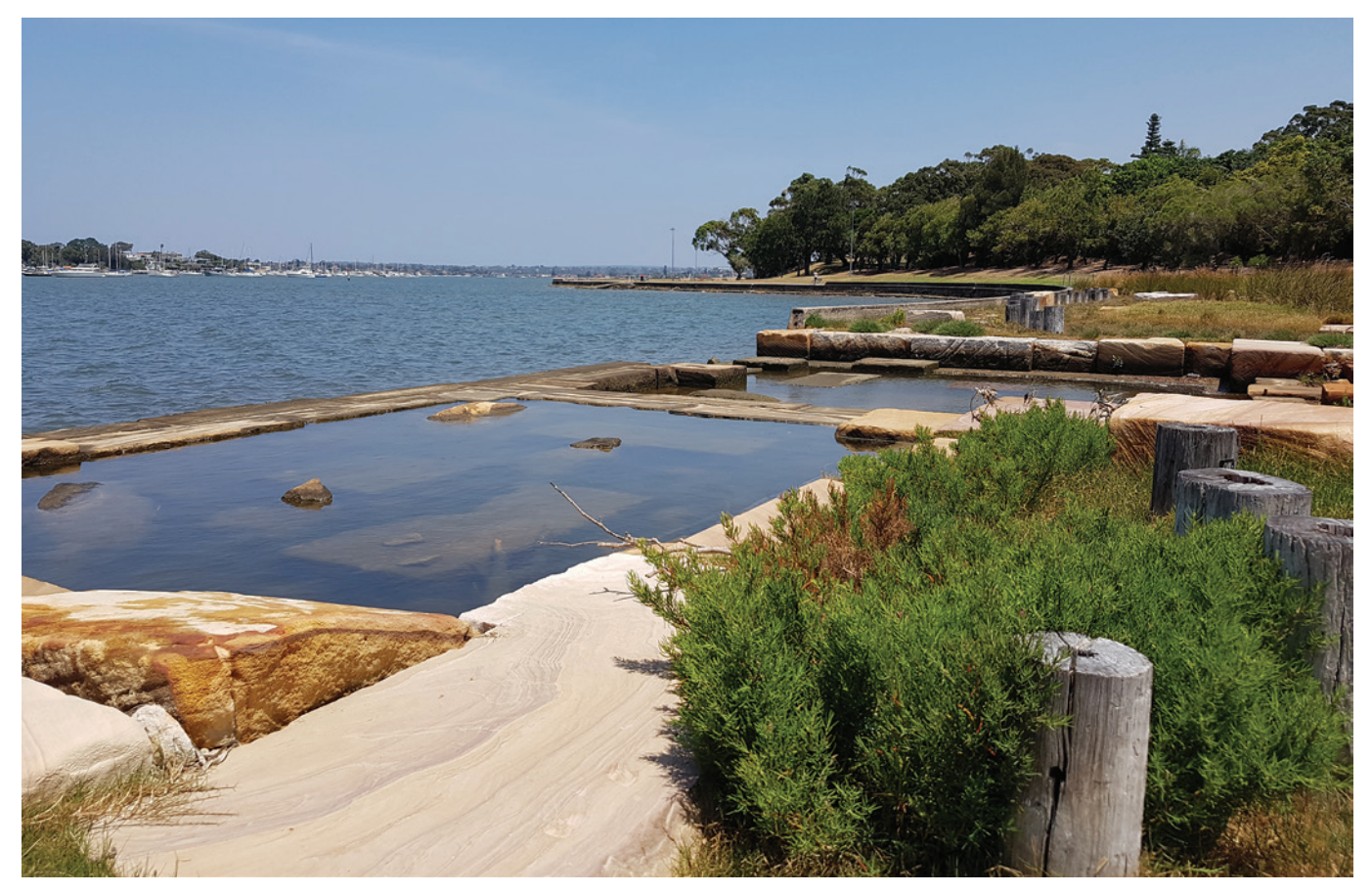
Figure 1. Section of the completed Carss Bush Park seawall including rockpools and saltmarsh.

Georges River Council is moving towards new foreshore development projects which enhance habitat complexity, supplement existing natural foreshore areas and improve biodiversity. Carss Bush Park seawall is the largest example of the Georges River Council's foreshore habitat improvement approach.