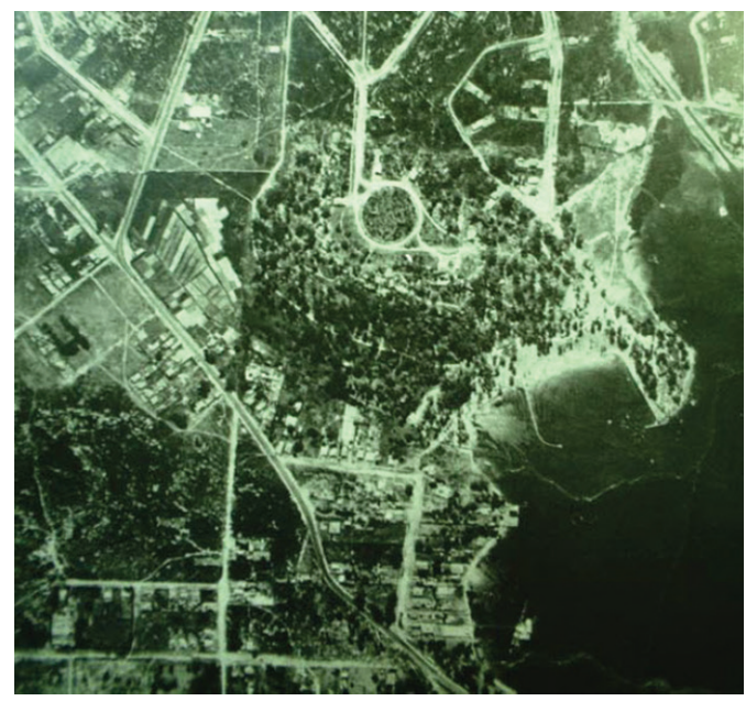
a) 1937 – reclamation commenced.

Figure 2. Historical aerial photographs of Carss Bush Park demonstrating the changing foreshore structure and shape from early on during the reclamation process in 1937, to reclamation completion in 1982, to the 2015 shape and structure prior to new foreshore construction.