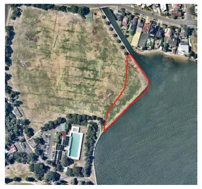
c) 2015 – seawall prior to work (stage one identified).