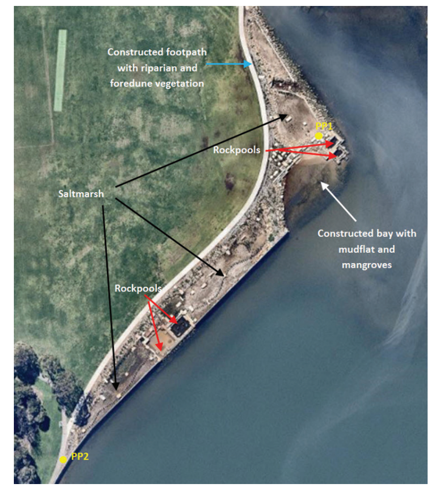
Figure 3. Aerial of completed seawall identifying key features. (PP - Photo points).

The Carss Bush Park seawall was examined from both a scientific and engineering approach to not only develop an original seawall design, but to ensure the successful construction and long-term structural integrity of the project. The foreshore has also been designed with future adaptability to climate change incorporated; ensuring the aesthetics and success of the project are not impacted by sea level rise.