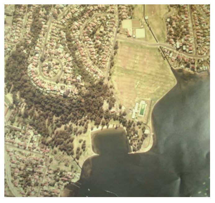
b) 1982 – reclamation complete.