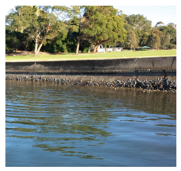
2015 - concrete seawall section.

02 | CARSS BUSH PARK ENVIRONMENTALLY FRIENDLY SEAWALL - STAGE 1 | CASE STUDY | AUGUST 2017